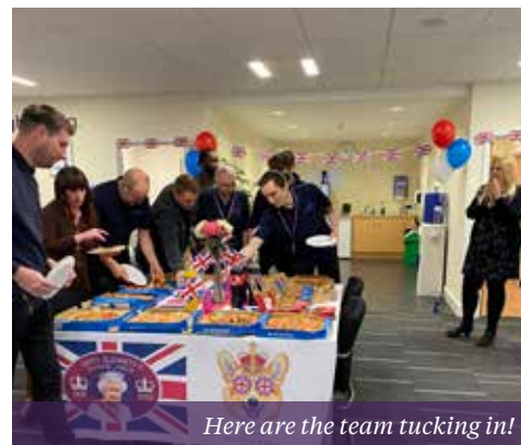
Here are the team tucking in!