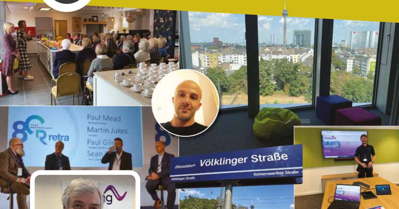
↑ A selection of the activities of the companies